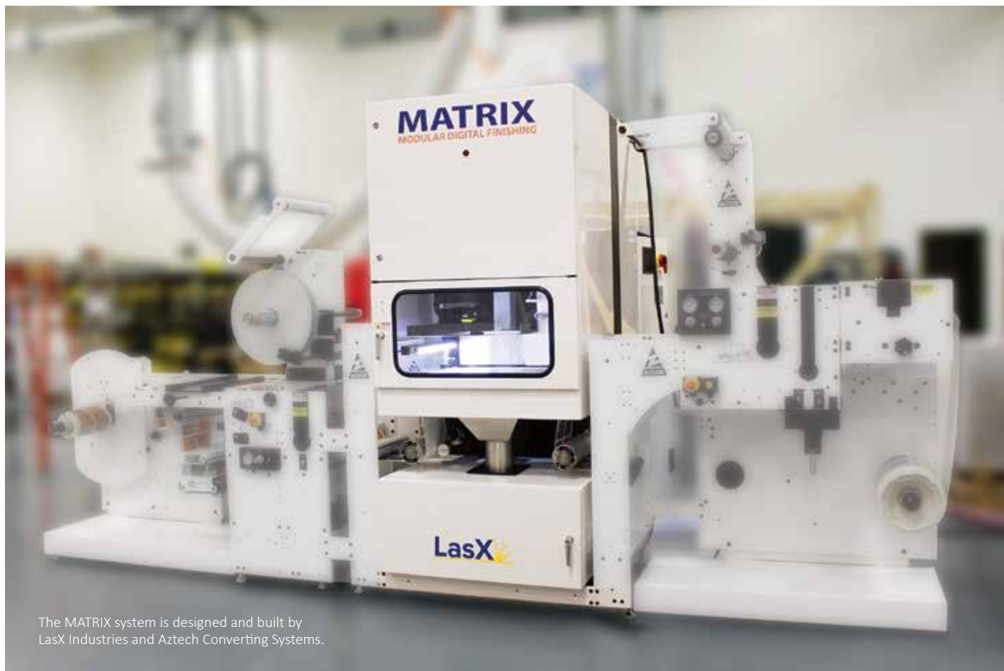
The MATRIX system is designed and built by LasX Industries and Aztech Converting Systems.

Versatile, scalable laser cutting solution custom engineered for your application.