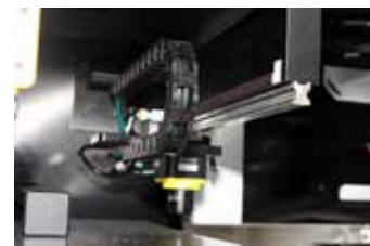
Optional vision registration system